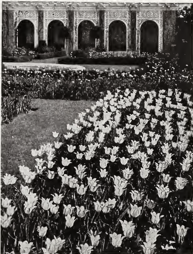
A well-thought-out arrangement of Darwin and Breeder Tulips, with the Cottage Tulip Picotee in the foreground